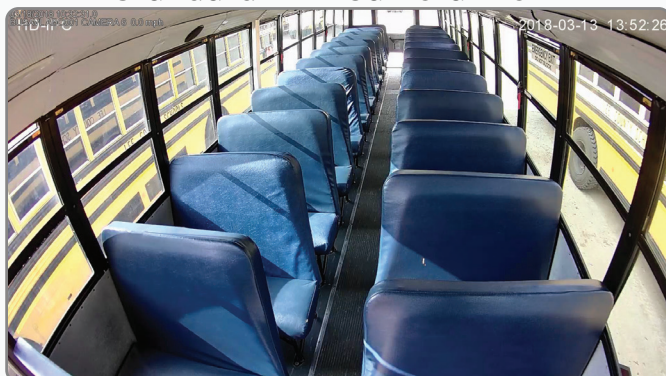
Standard 247 Camera View

Clear sharp images. Standard on all 247 Cameras. TruView images comparable to our standard cameras.