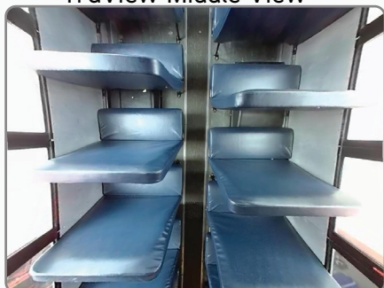
TruView Middle View