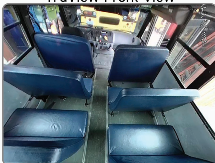
TruView Front View